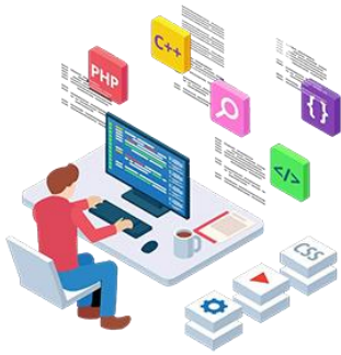
Admin Control Panel